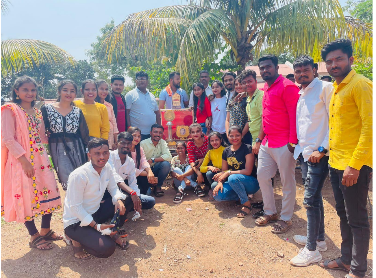
Champion trophy Winning Team Kisan Veer Mahavidyalaya, Wai.

https://kvmwai.edu.in/KVM/Cultural Department